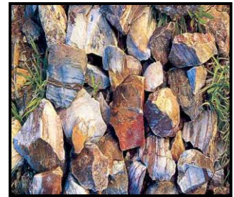
Alibates Texas Flint