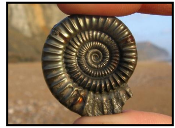
Pyrite Ammonite (Echioceras) from Charmouth, England

Flint , at http://geology.com/rocks/flint.shtml , is a nice treatise about the subject, well-illustrated. The site leads one through what flint is, its use for stone tools, some historic flint quarries, (see separate sites at http://www.flintridgeohio.org/ and http://www.nps.gov/alfl/index.htm ), use as a fire source striking steel with it, and use as a gemstone.